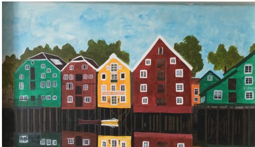
Susy Stein « Alles an der Reih » acrylics on plywood