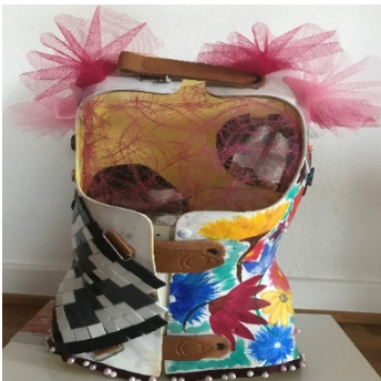
Chiara Guinet- Venzi « Corset » sculptural installation polyester, fabric, tiles, acrylics