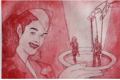
Wiebke Schuh « On a tray » copper print